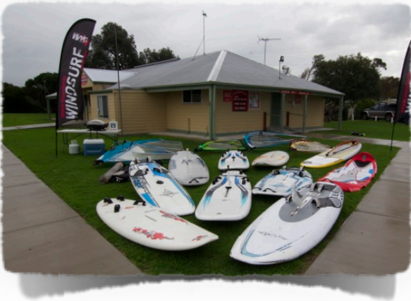
Over the past 4 years, IWC has accumulated a large amount of equipment which is available for community use.

Over the past few months, the Windsurfing Club has highlighted to Council that it urgently requires an area or facility to store it's equipment. At present, the Club's equipment is stored in garages and in the back of member's cars- which is not a practical or long term solution to providing a "local home base" with ease of access for its members or the general community.